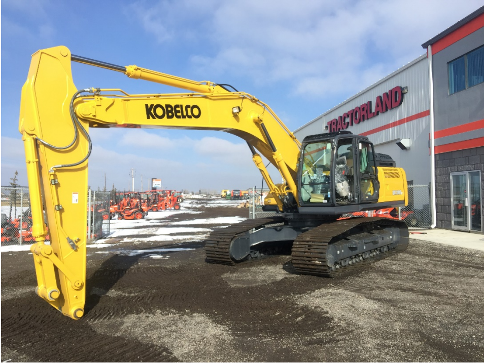
Photo Caption 2: Tractorland will offer sales, rentals, parts and service on the full line of KOBELCO excavators from their location in Balzac, Alberta.