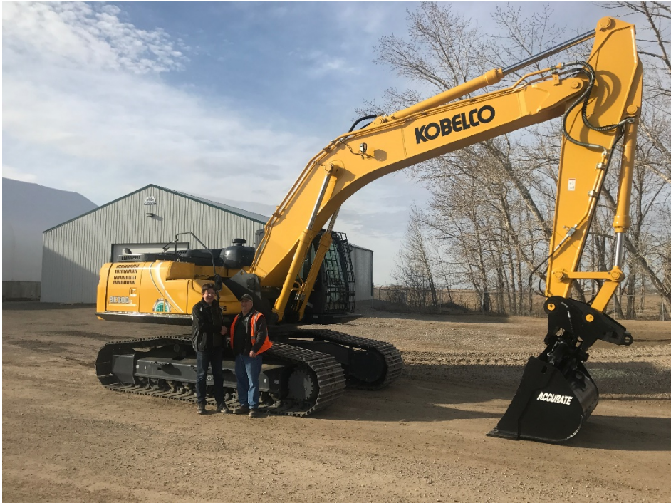
Photo Caption 3: Tractorland’s first KOBELCO excavator sold to Wheatland County.