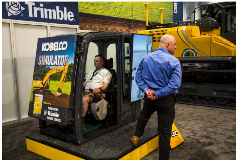
Photo Caption 3: CONEXPO-CON/AGG attendees enjoyed operating the KOBELCO Machine Control simulator with Trimble technology.