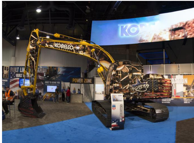
Photo Caption 1: The KOBELCO SK210LC-10 displayed at CONEXPO-CON/AGG with a custom graphics wrap.