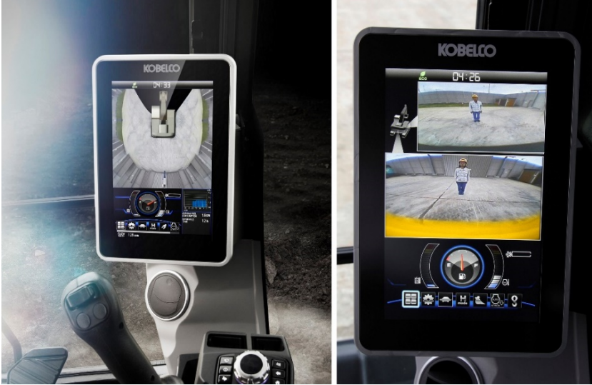
Photo Caption 3: The ED160BR-7 features a new 10-inch color monitor with a split-screen display function to customize operator viewing needs.