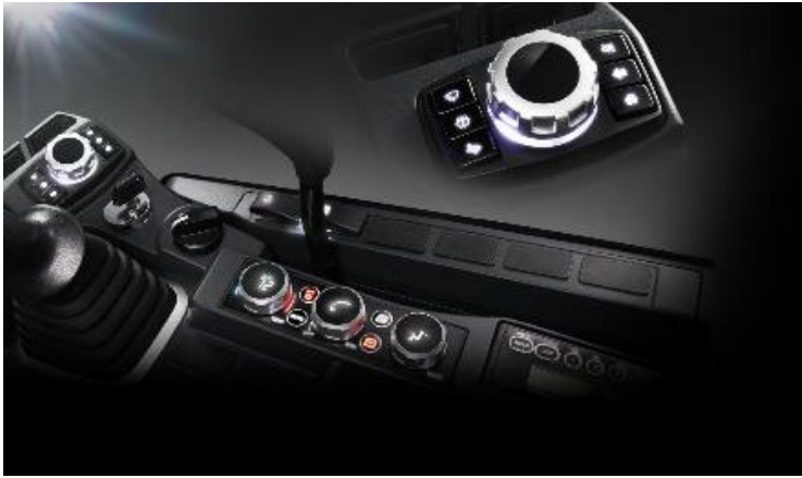
Photo Caption 4: The jog dial and controls on the ED160BR-7 are backlit to provide a bright, clear view in any lighting condition.