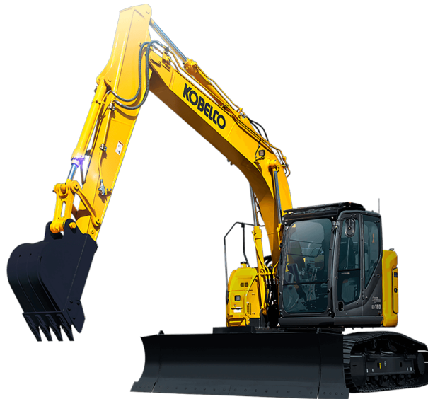
Photo Caption 1: The enhanced KOBELCO ED160BR-7 Blade Runner delivers unmatched power and performance capabilities.